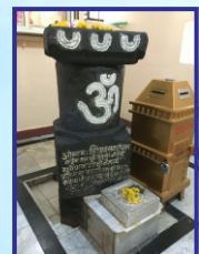
Mother of Hanuman ... Anjneri Fort and Anjneri Mandir