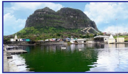
Saptashrungi Mandir Vani [Nasik]