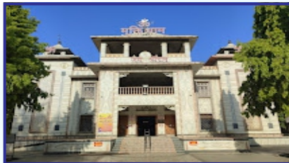
Mukti Dham Mandir Nashik