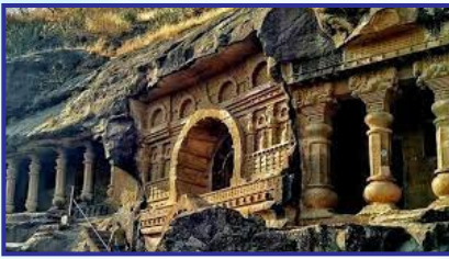
Pandav Leni, Nashik