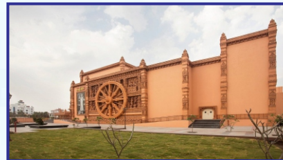
Sai tirth Theme Park